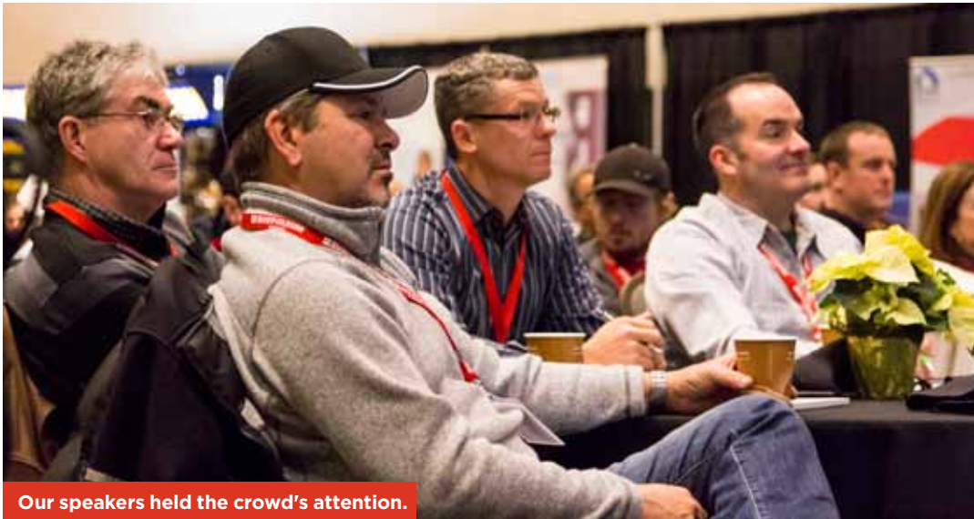
Our speakers held the crowd's attention.