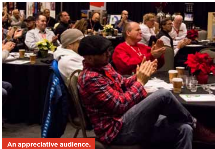
An appreciative audience.